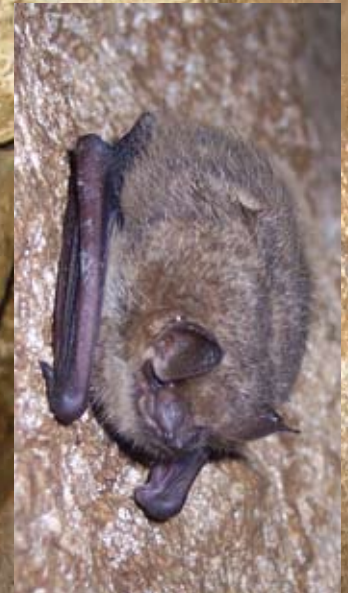
A Little Brown Bat noticed in one of the caves by a second TCG trip on the same day.