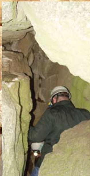
Jason Czarnecki follows Dawn Hill down into the first cave at Rattlesnake Point.