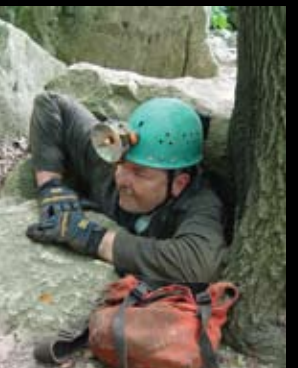
second cave at Rattlesnake Point.