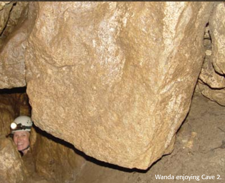
Wanda enjoying Cave 2.