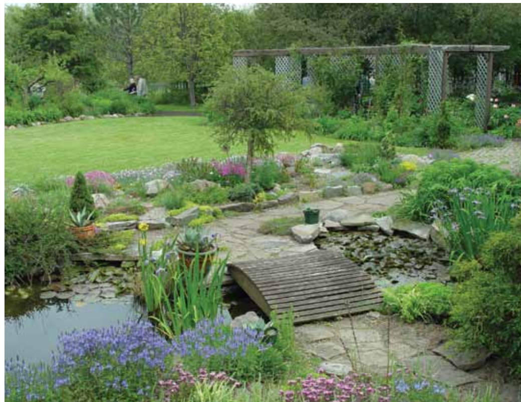
In the country outside of Georgetown, a rural garden can ramble over a large area, inviting a walk over a stream, past a rock garden, through a pergola and beyond. The only limit to a country garden is time, energy or resources, and usually all three!