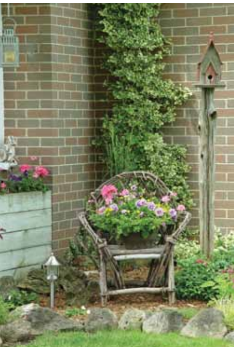
With a small town property, attention to detail pays off. This Georgetown gardener has created a pretty focal point in a corner of the front yard with vertical interest, bright annuals, rocks, mulch and perennials.