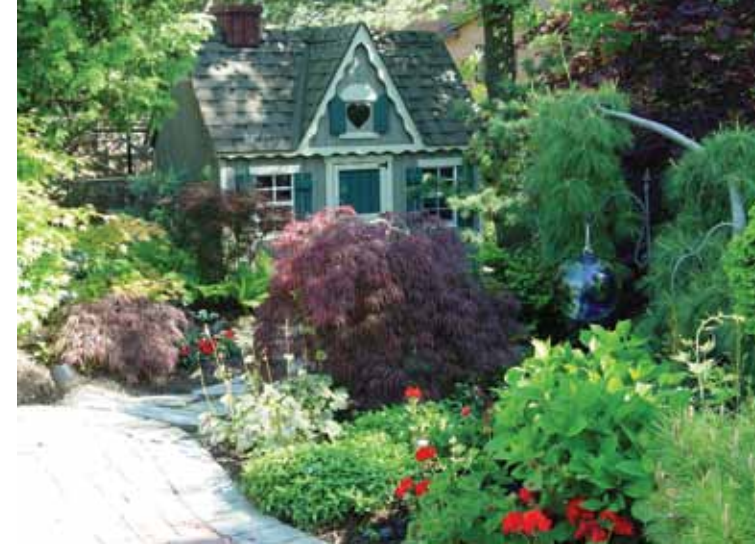
This tiny gingerbread cottage in the back yard of a Niagara-on-the-Lake house is actually the pool's pump house. Having small plants in front of it keeps the view open and makes it seem larger. While the owner of this 10-year-old garden claimed he never planted a thing, his landscaper argued that he has a very good eye. The result of their disagreements is harmony.