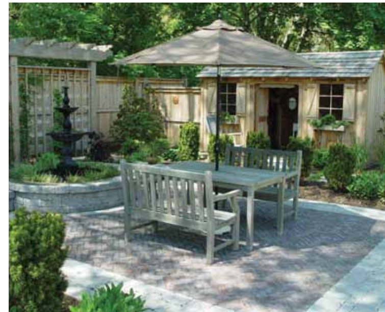
"We love to garden but don't want to be a slave to it," says the owner, and this could have been her brief to the landscape designer who created this space in Niagara-on-the-Lake about two years ago. No lawn, tall fences and structures, plenty of living and entertaining space and several all-season garden beds have transformed this back yard into a private sanctuary.