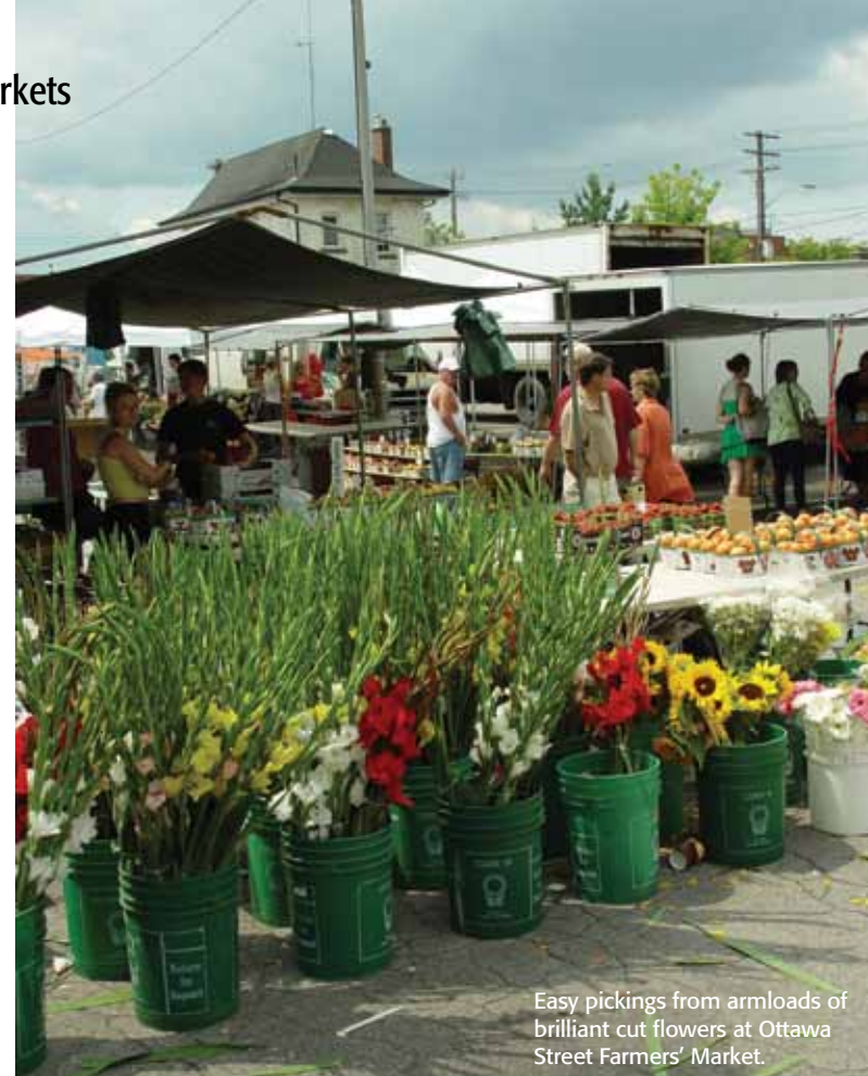
Easy pickings from armloads of brilliant cut flowers at Ottawa Street Farmers' Market.

Visitors also have an opportunity to learn more about community initiatives as the market extends a hand to such local non-profit organizations as Hamilton Food Share, Hamilton Green Venture, and the Greenbelt Foundation by providing space for groups to promote their activities. Environment Hamilton's Eat Local program is another organization to benefit by their association with the market, having launched their first two