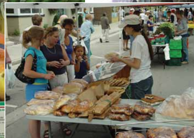
Smell the freshly baked goods at Georgetown Farmers' Market.