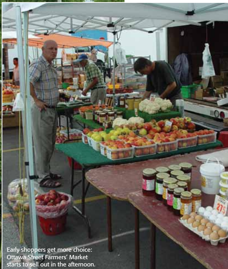
Early shoppers get more choice: Ottawa Street Farmers' Market starts to sell out in the afternoon.