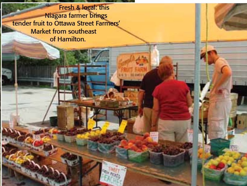
Fresh & local: this Niagara farmer brings tender fruit to Ottawa Street Farmers' Market from southeast of Hamilton.