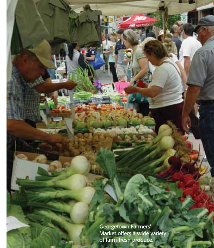
Georgetown Farmers' Market offers a wide variety of farm-fresh produce.