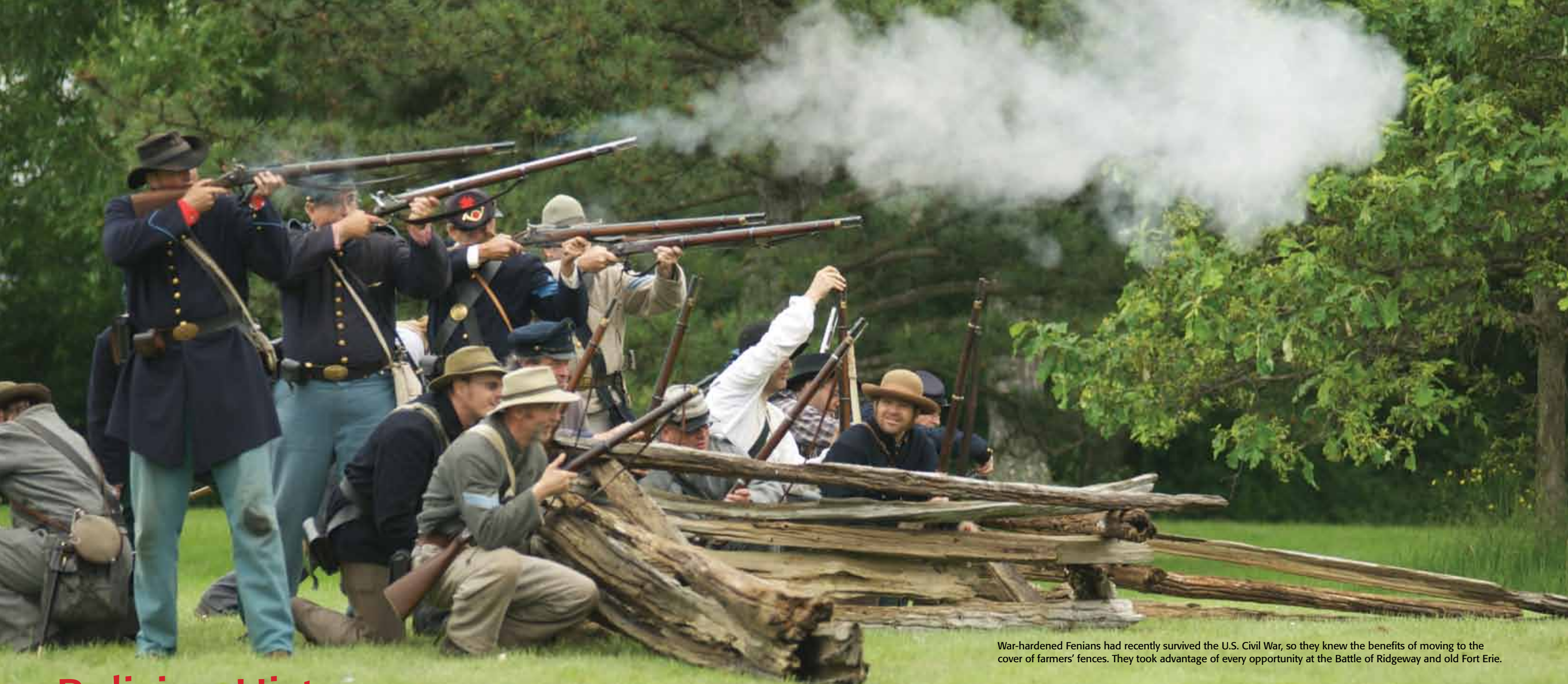
War-hardened Fenians had recently survived the U.S. Civil War, so they knew the benefits of moving to the cover of farmers' fences. They took advantage of every opportunity at the Battle of Ridgeway and old Fort Erie.