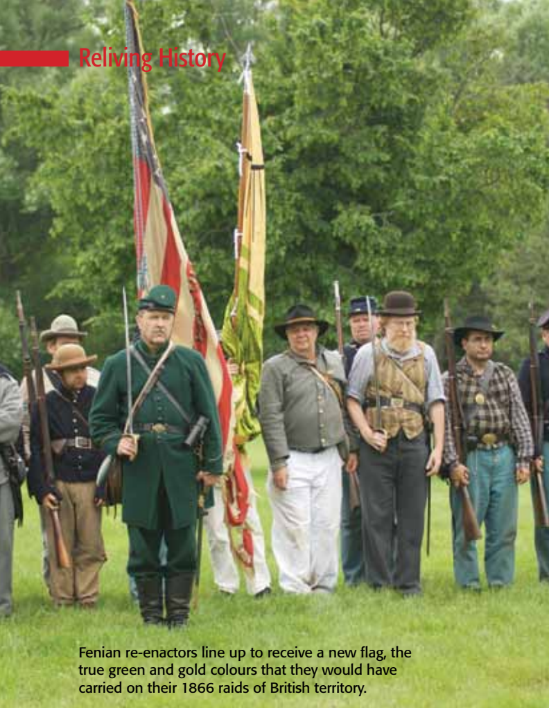
Fenian re-enactors line up to receive a new flag, the true green and gold colours that they would have carried on their 1866 raids of British territory.