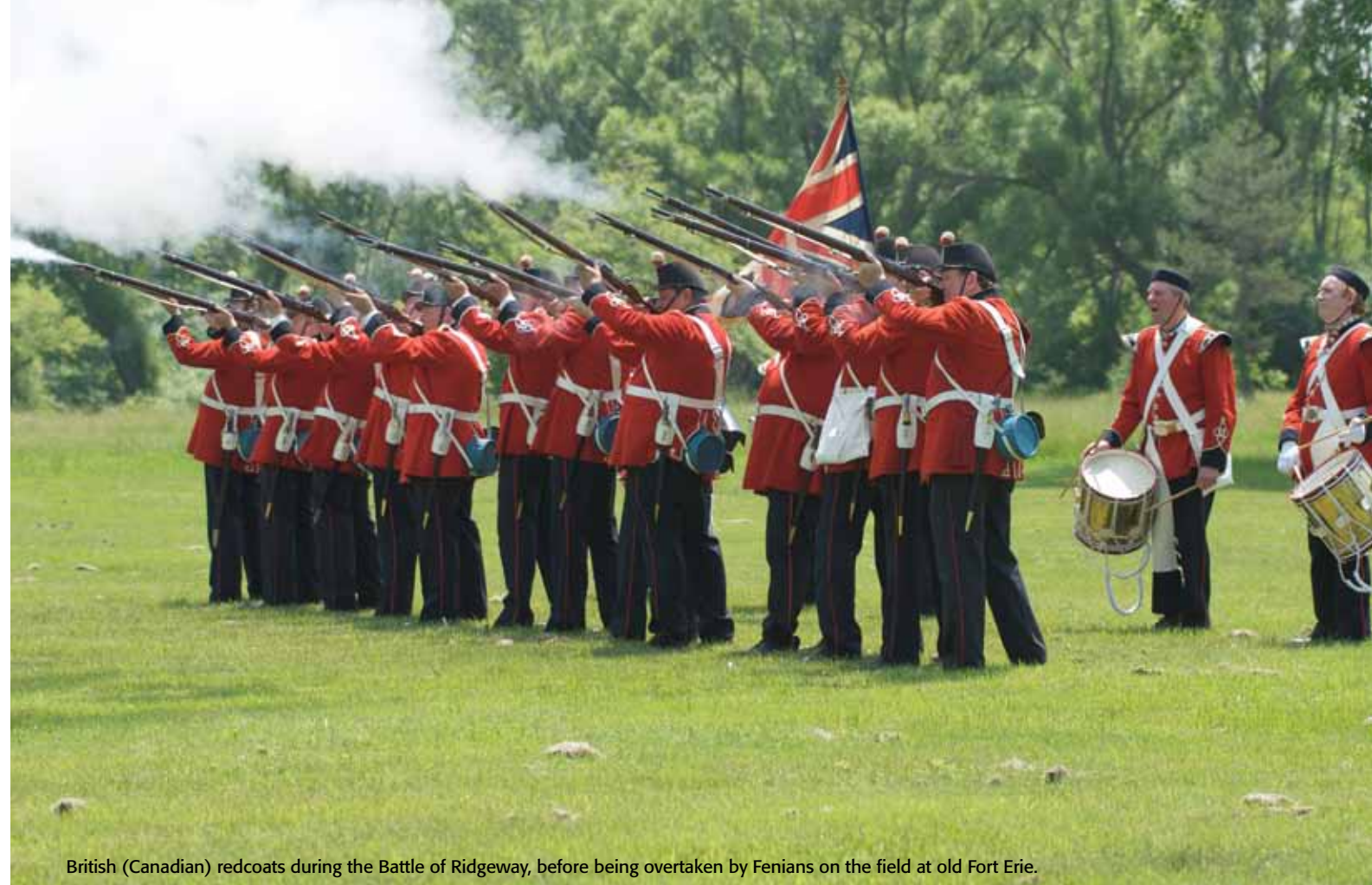
British (Canadian) redcoats during the Battle of Ridgeway, before being overtaken by Fenians on the field at old Fort Erie.