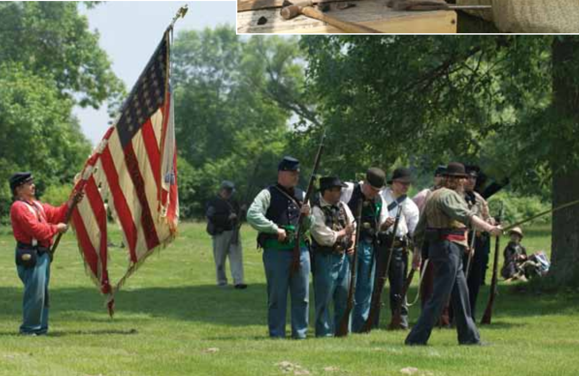
A flagbearer carries the flag of the 155th New York Volunteer Infantry of Irish from south Buffalo, still used in re-enactments of Civil War and Fort Erie battles.