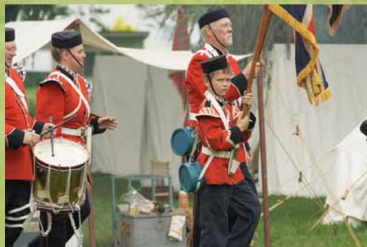
Women and children at war: women fought in 19 th -century battles, sometimes disguised as males. This woman is a fife player in the regimental band, behind a boy flag bearer. In 1866 young sons of soldiers could join the forces as flag bearers or drummers.