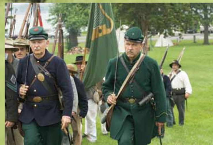
Fenian re-enactors march from their camp to the battlefield. The flag of green with a gold harp shows artistic licence; it was designed from a painting of the Battle of Ridgeway.

They arrive in buses, vans and cars, from the U.S.A. and from across Canada. Men and women