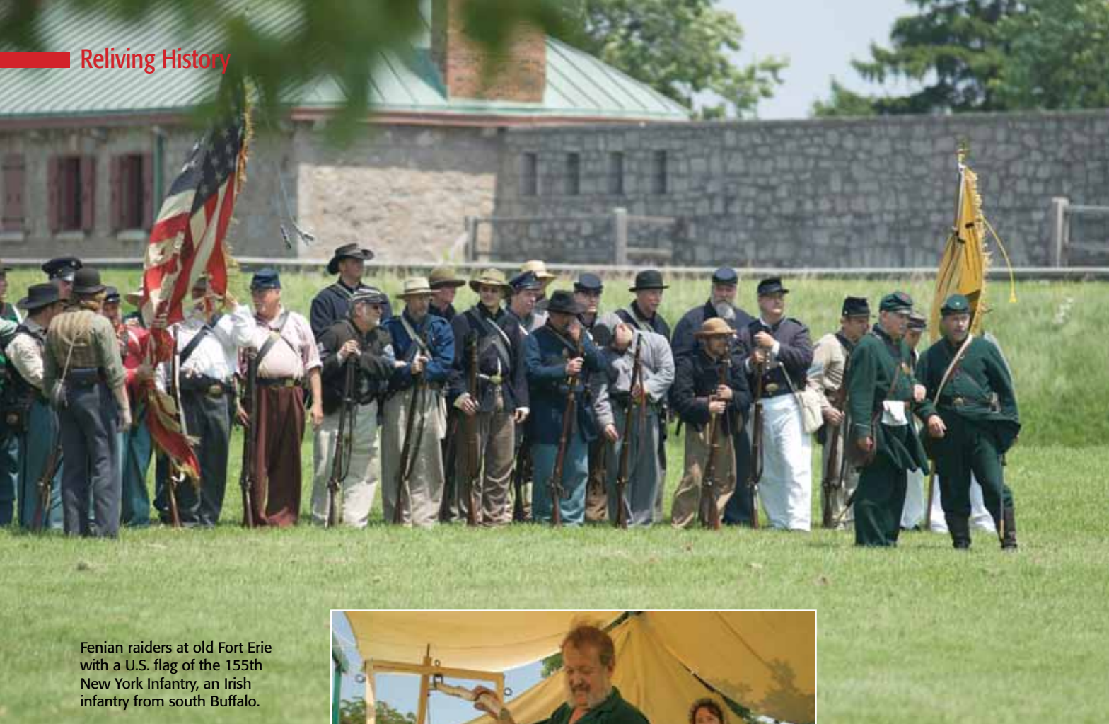
Fenian raiders at old Fort Erie with a U.S. flag of the 155th New York Infantry, an Irish infantry from south Buffalo.