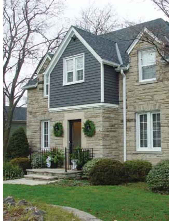
The annual house tour to benefit the United Way of Georgetown featured fine houses in the downtown area, on Nov. 19.