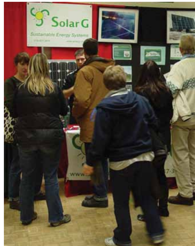
On Jan. 29 & 30, visitors to the Guelph Organic Conference Expo crowded round exhibitors like Solar G, a provider of solar and wind systems.