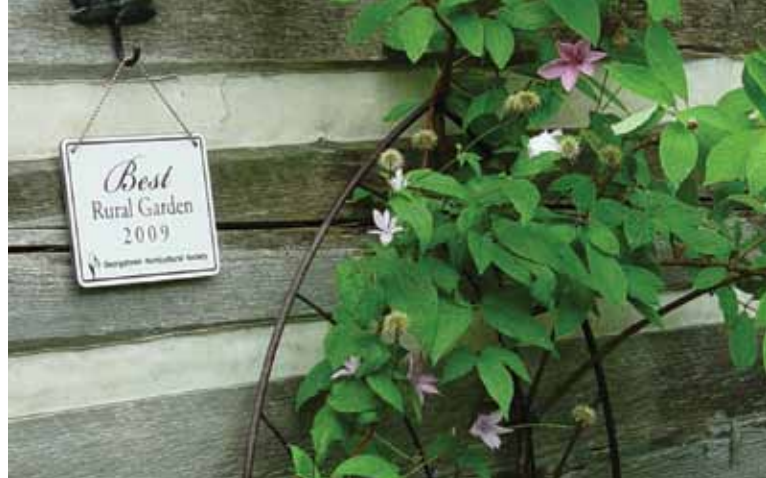
Ruth's garden is award-winning. Proof is displayed modestly yet proudly at the side of the house near a shy clematis.