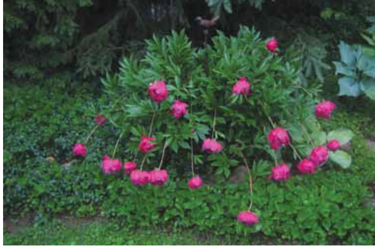
Peonies after a light rain.

“But actually, I hate when there is too much bloom. It’s too much. I like the balance of green. I love green foliage. But I love burgundy foliage too. And charreuse. So foliage and the form of plant material is very important. Structure is too, in shrubs and trees. I have to have grasses as well, for summer, fall and winter interest. And of course hardscape, like arbours, obelisks, statues, urns and pots, is great because it never dies! We leave