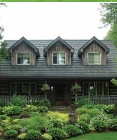
The Youngs' log house has a wide front verandah to enjoy the hosta bed in front and the natural pond beyond.

T he garden has been significantly transformed from what it was when the Youngs moved here 14 years ago. Ruth remembers that there were some boxwoods at the front door, a couple of peonies, huge yews at the side of the house, and junipers and weigela decorating the pool area. "And a huge black walnut in front of the house," she adds.