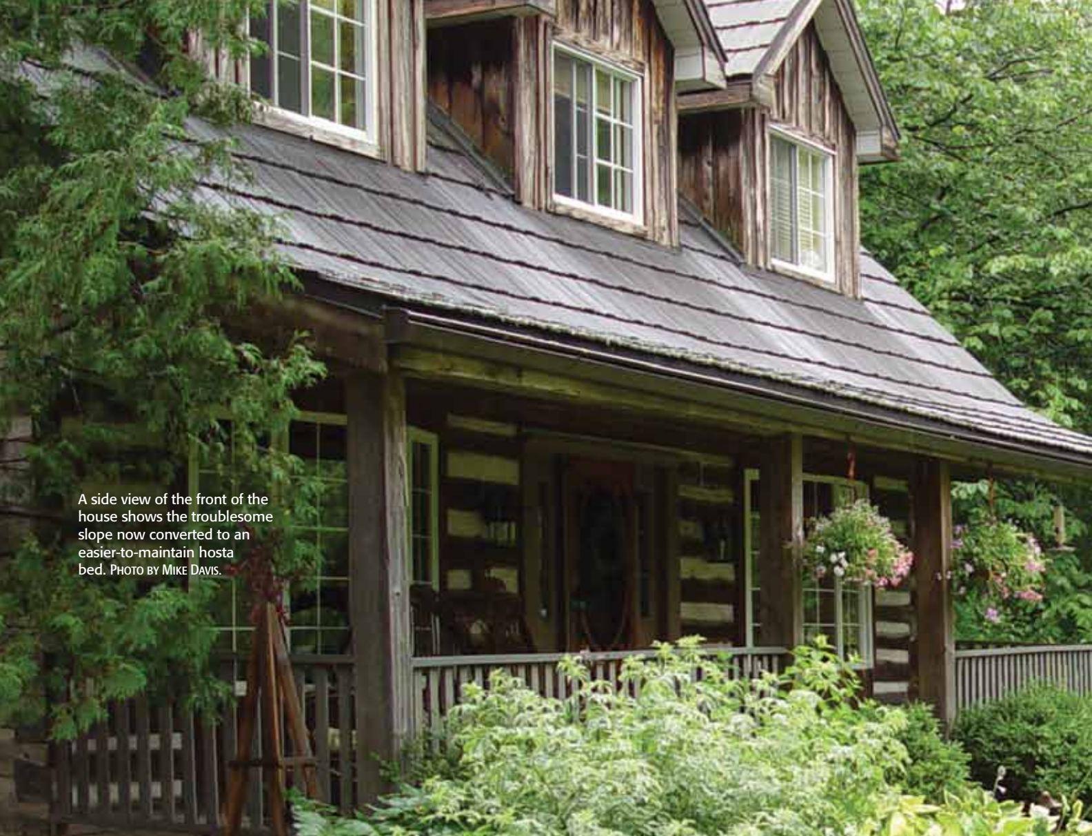
A side view of the front of the house shows the troublesome slope now converted to an easier-to-maintain hosta bed.