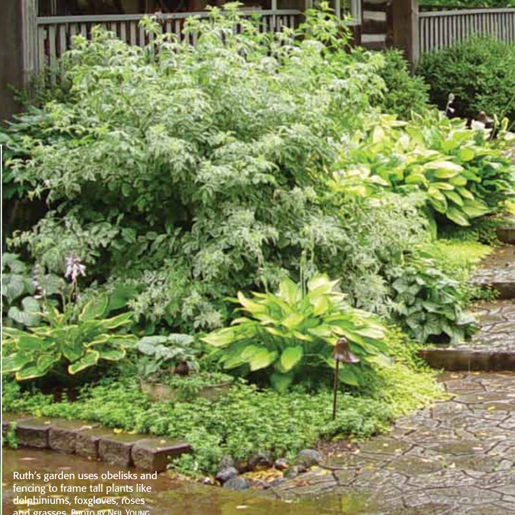
Ruth's garden uses obelisks and fencing to frame tall plants like delphiniums, foxgloves, roses and grasses.